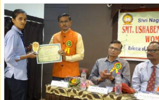
Best NSS Cadet Award