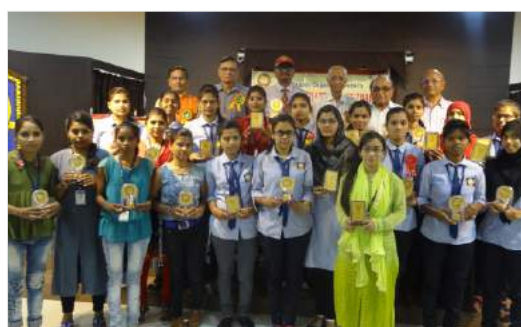
Various Activities Competitions Awards given to Students