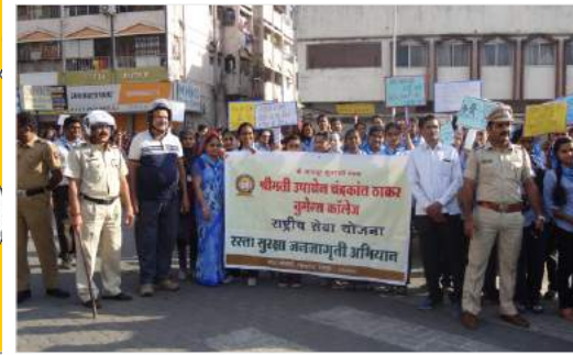
Road Safety Rally