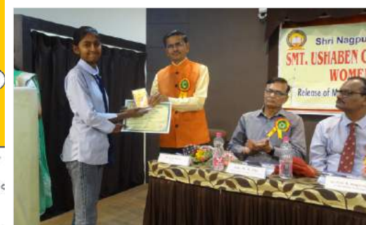
Library User Award