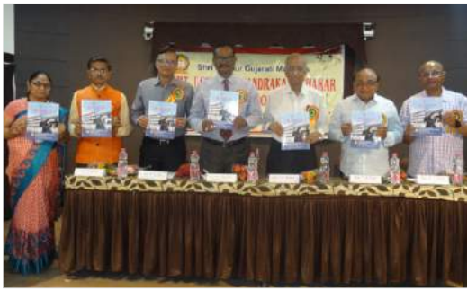
College Magazine Release Ceremony